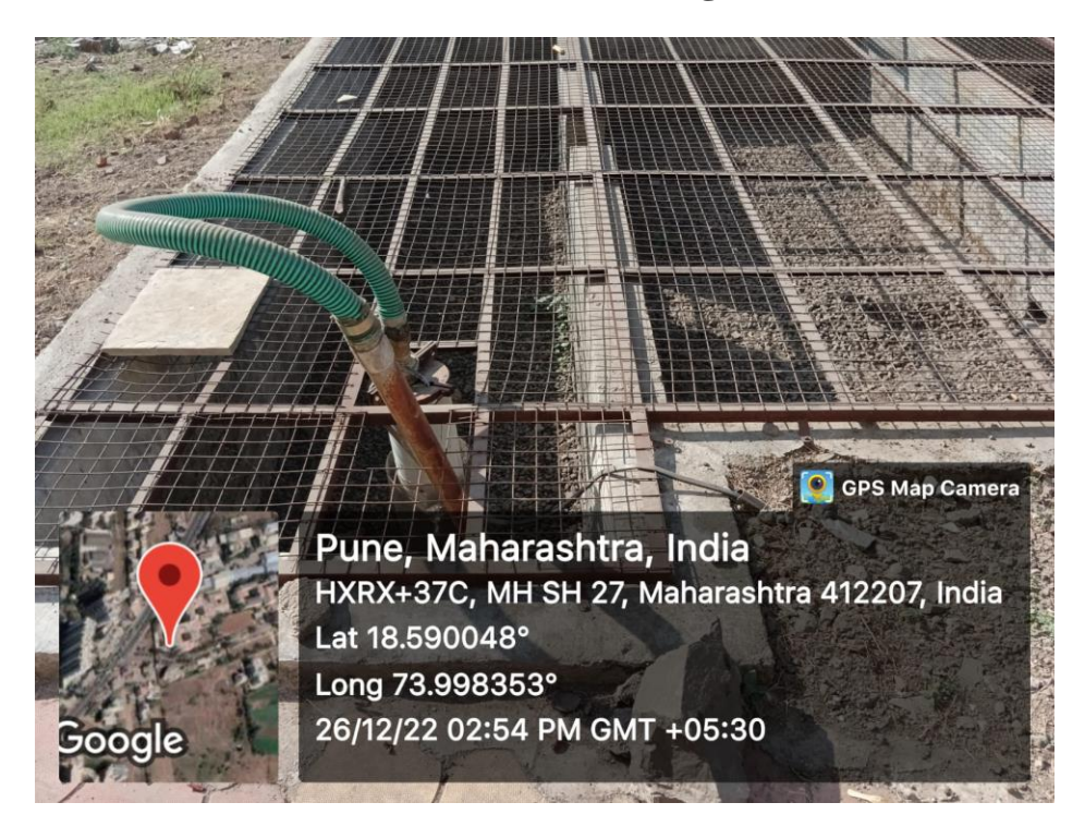
Rain water harvesting 3