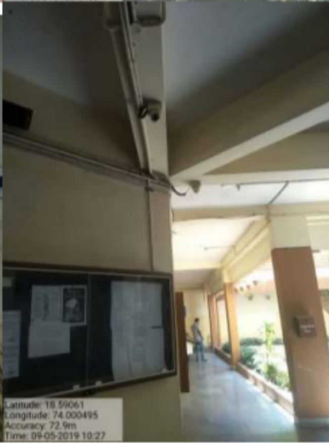
Latitude: 18.59061 Longitude: 74.000495 Accuracy: 72.9m Time: 09-05-2019 10:27