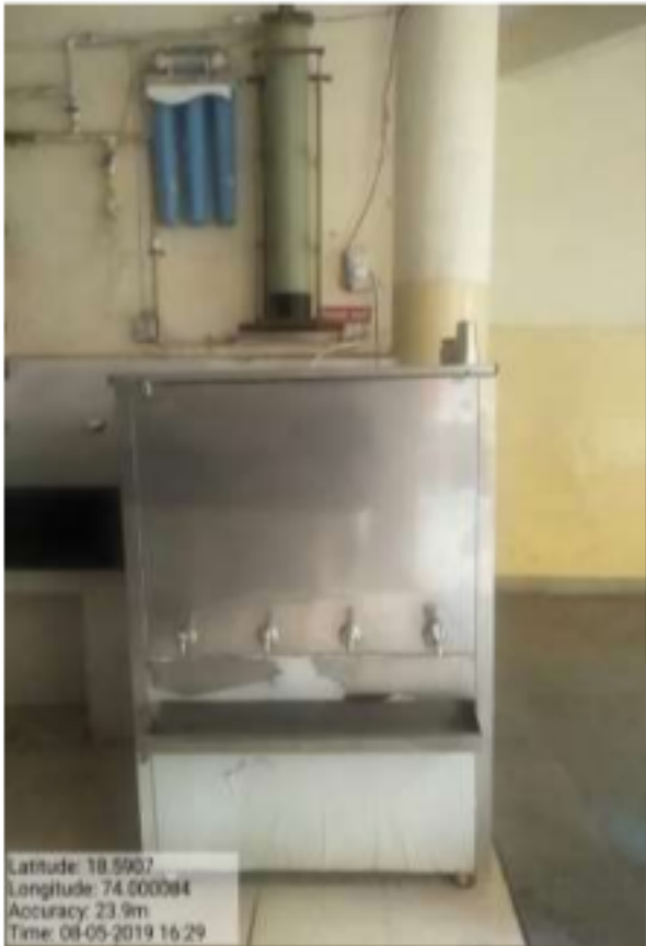
Latitude: 18.5907 Longitude: 74.00084 Accuracy: 23.9m Time: 08-05-2019 16:29