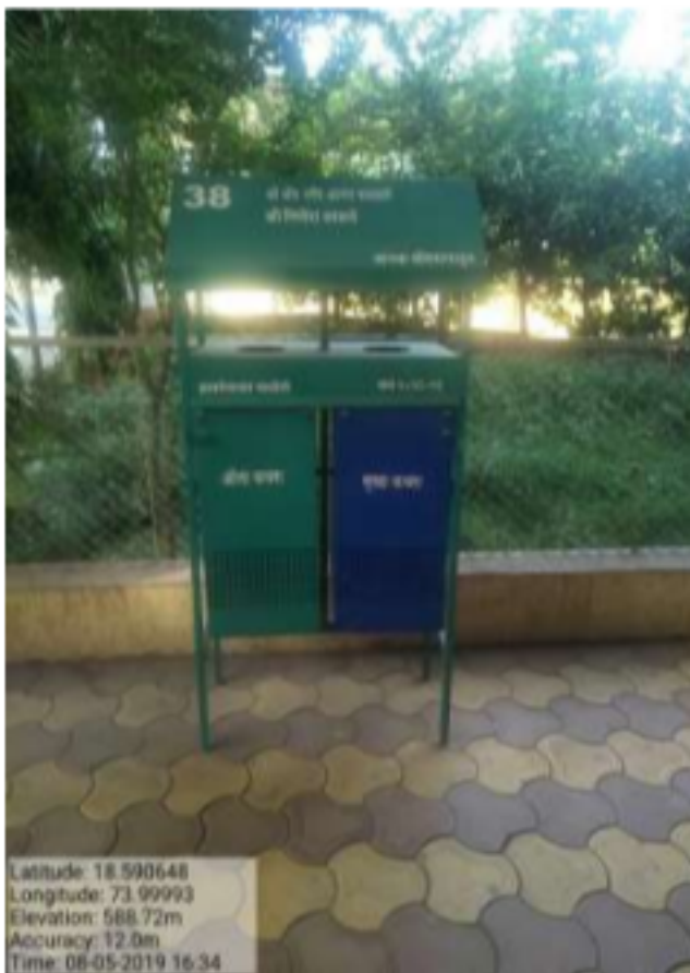
Latitude: 18.590648 Longitude: 73.99993 Elevation: 588.72m Accuracy: 12.0m Time: 08-05-2019 16:34