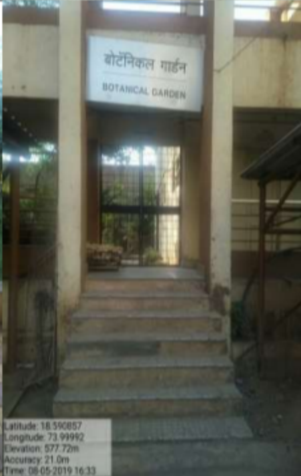
Latitude: 18.590857 Longitude: 73.99992 Elevation: 577.72m Accuracy: 21.0m Time: 08-05-2019 16:33