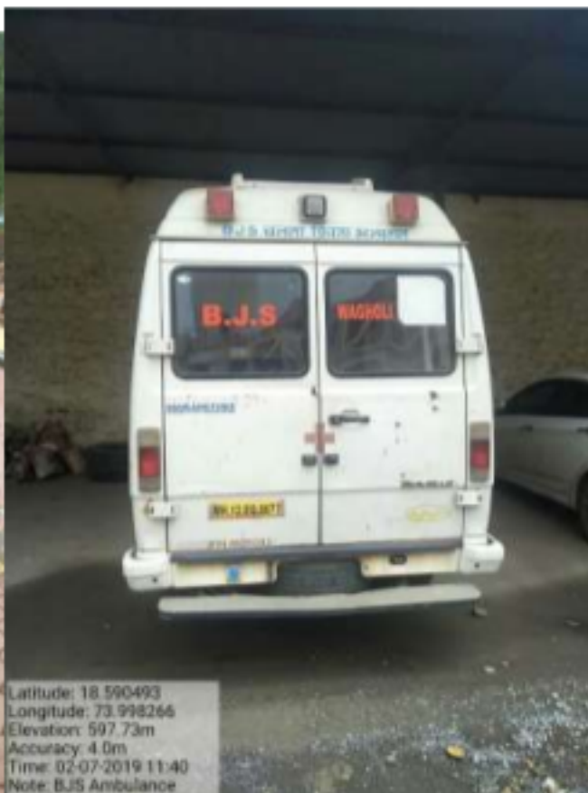
Latitude: 18.590493 Longitude: 73.998266 Elevation: 597.73m Accuracy: 4.0m Time: 02-07-2019 11:40 Note: BJS Ambulance