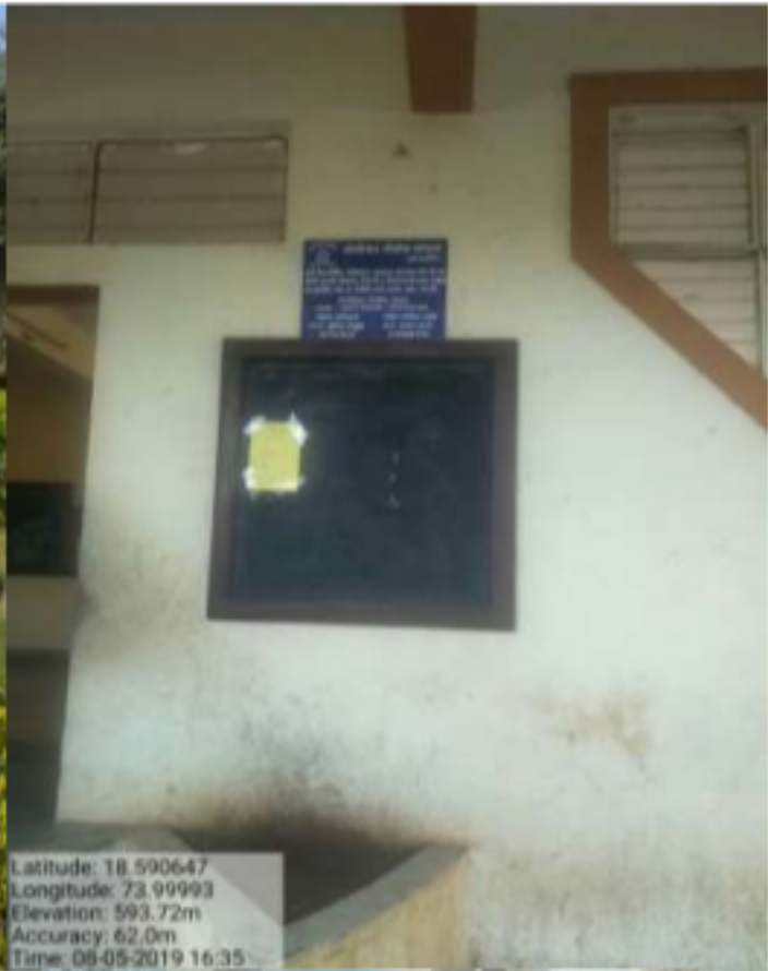
Latitude: 18.590647 Longitude: 73.99993 Elevation: 593.72m Accuracy: 62.0m Time: 08-05-2019 16:35