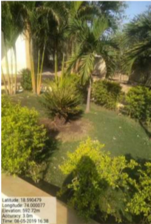
Latitude: 18.590479 Longitude: 74.00077 Elevation: 592.72m Accuracy: 3.0m Time: 08-05-2019 16:38