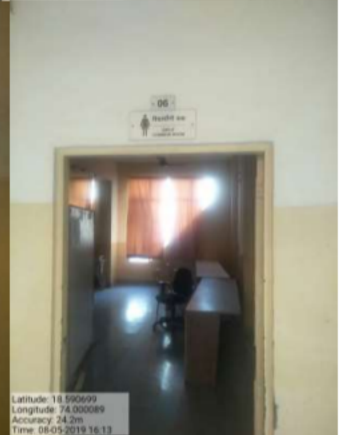
Latitude: 18.590699 Longitude: 74.000089 Accuracy: 24.2m Time: 08-05-2019 16:13