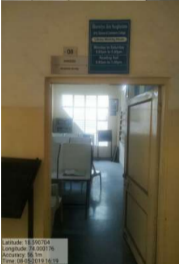
Latitude: 18.590704 Longitude: 74.000176 Accuracy: 56.1m Time: 08-05-2019 16:19