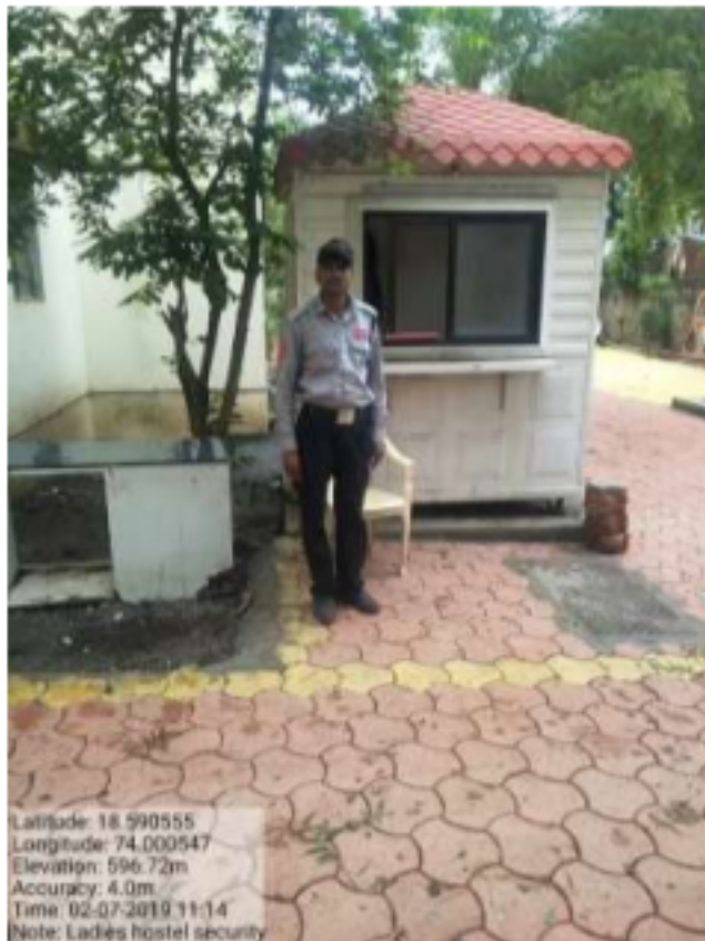
Latitude: 18.990555 Longitude: 74.000547 Elevation: 596.72m Accuracy: 4.0m Time: 02-07-2019 11:14 Note: Ladies hostel security