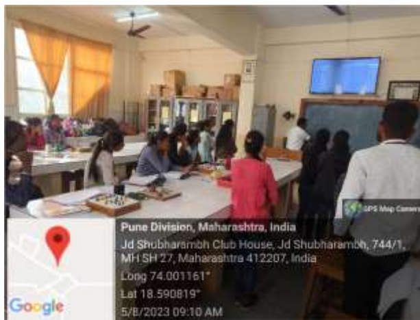
Room No: 20 Physics Lab 2