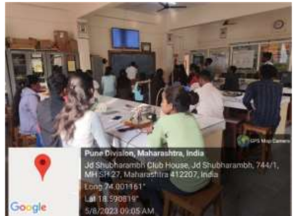
Room No: 20 Physics Lab