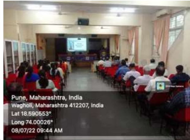
Room No: 10 BJS Gallery