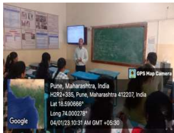
Room No: 42 B Chemistry