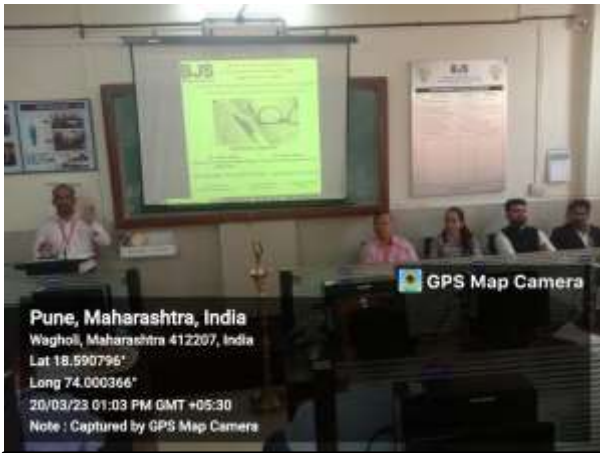
Room No: 17 BCA Science Lab