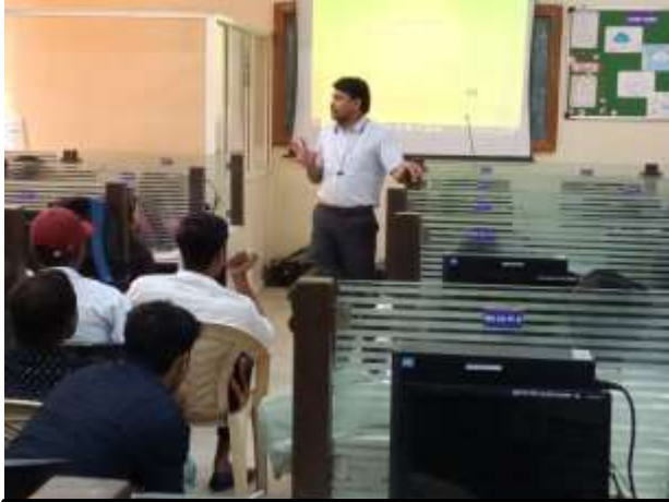
Room No: 09 BBA(CA) Lab

Classrooms and seminar halls with ICT- enabled facilities such as smart class, LMS, etc.