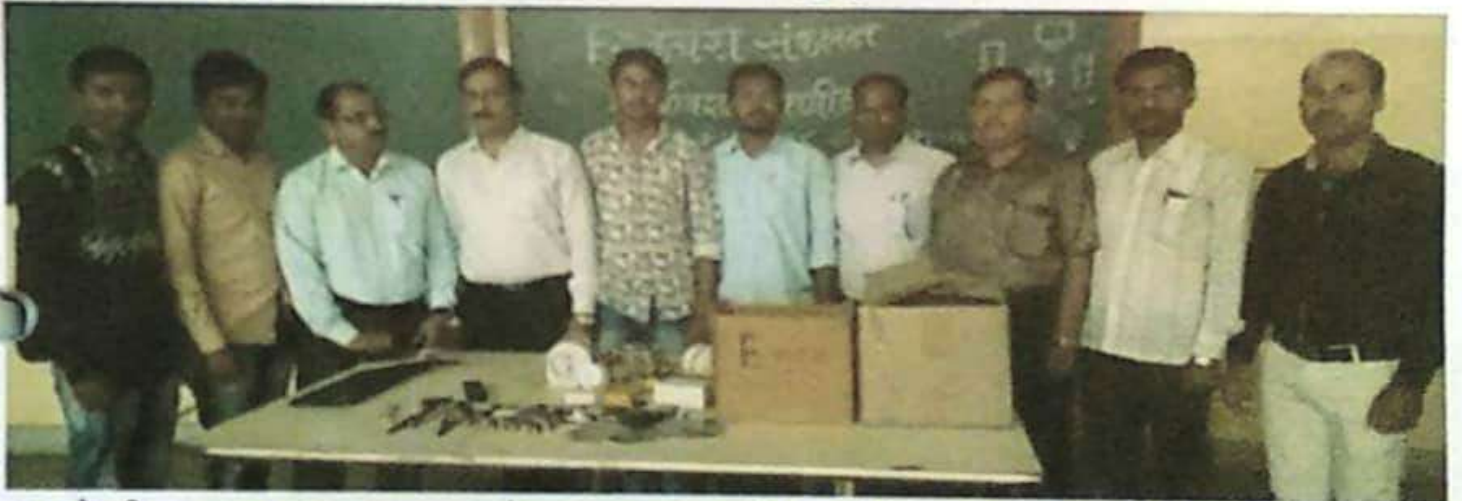
वाघोली : जमा करण्यात आलेला कचरा आणि उपस्थित शिक्षक व विद्यार्थी