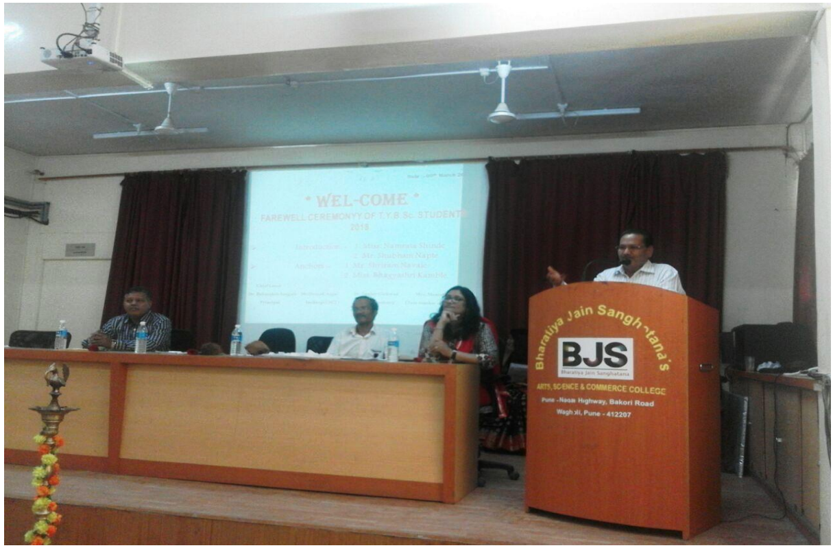
Principal addressing the TYBSc students at the time of farewell function on 9/3/2018