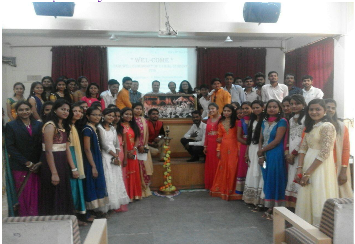
Principal, Teachers and TYBSc students at the time of farewell function on 9/3/2018