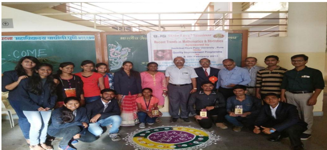
Some teachers and students participants after the Valedictory Function on 9/2/2018