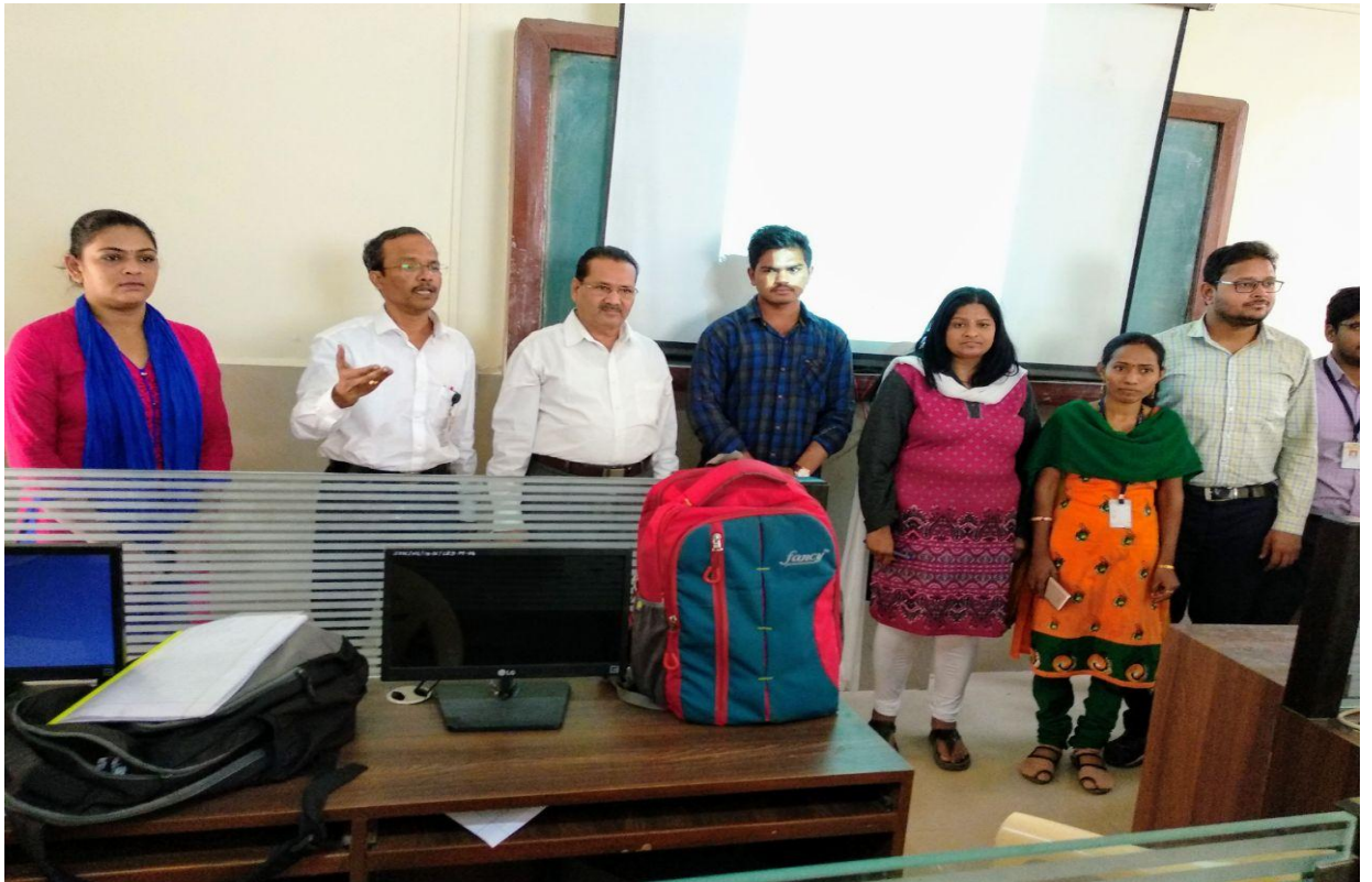
Principal and Teachers at the time of Lecture Series competition of science students on 10/2/2018