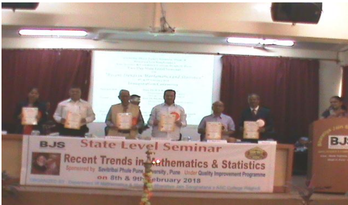
Abstract Book Publication at the time of State level seminar on Maths & Stats on 8/2/2018