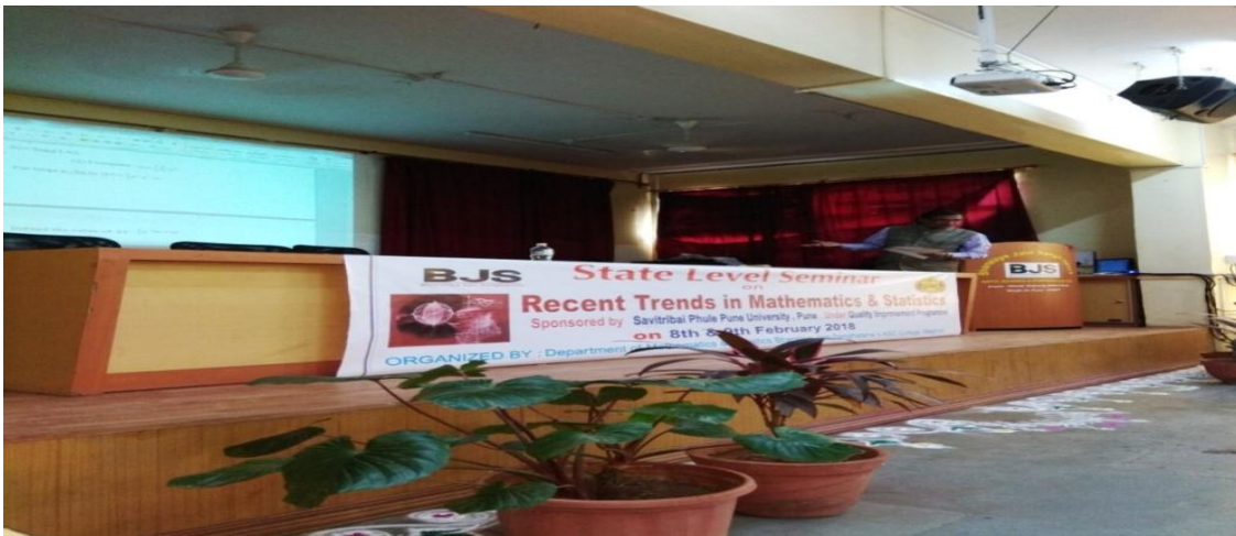
Dr.PrakashDixit(HOD Statistics,ModernCollege,Pune) delivering a lecture on ‘Simulation’ on 8/2/2018