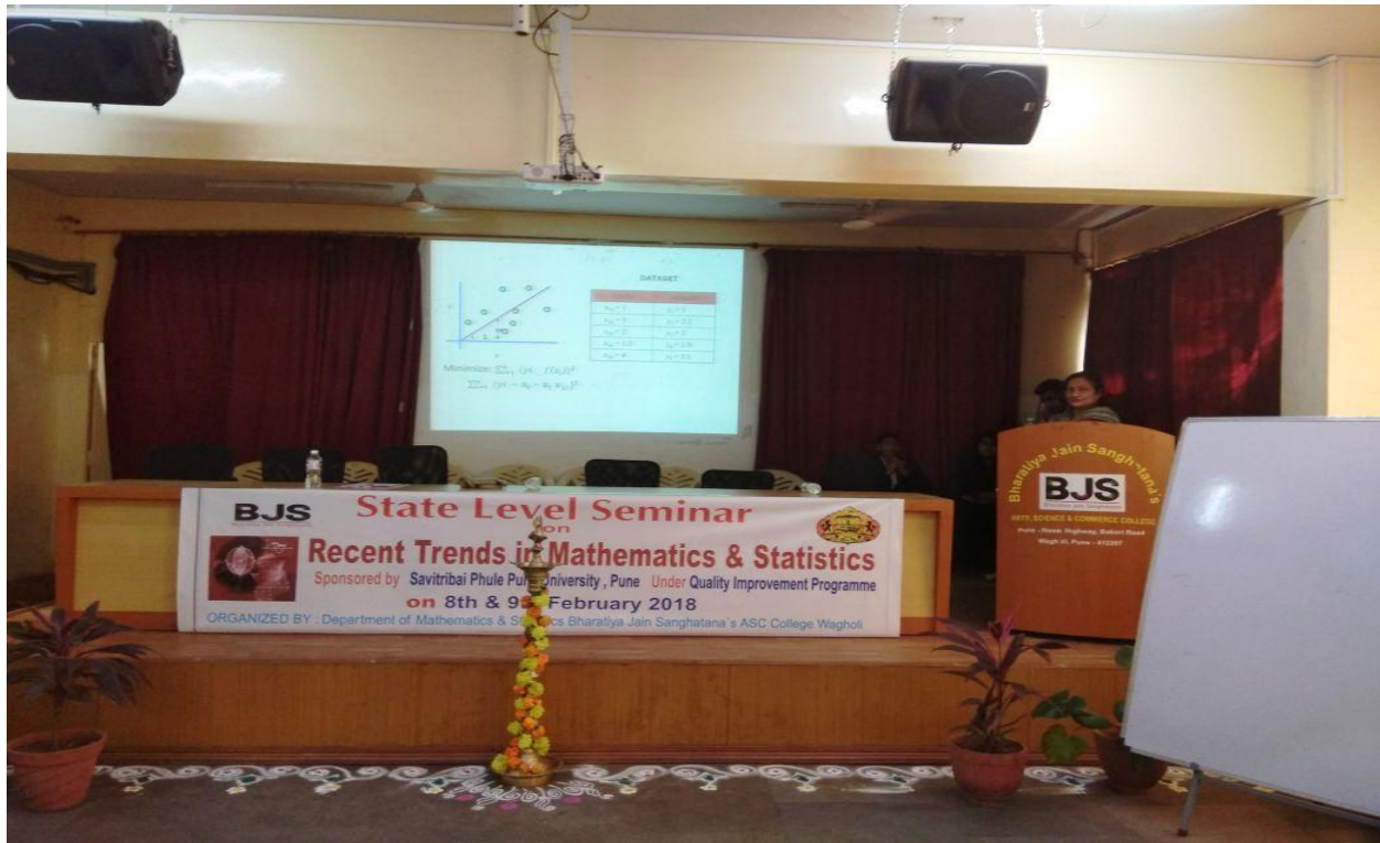
Dr.Uttara Naiknimbalkar(IISER,Pune) delivering a lecture on ‘Regression and Neural Networks’ on 9/2/2018